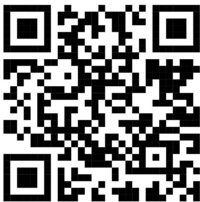
Chinese Register Form