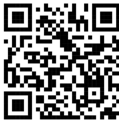
English Register Form